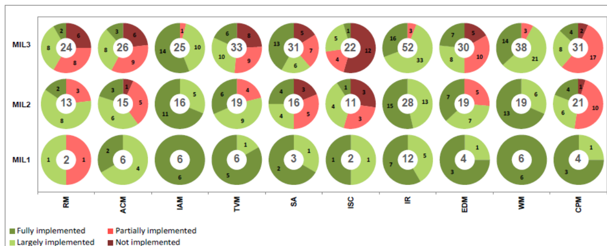
Figure 3. Domain View Example

In the Domain view, the number in the center of the doughnut indicates the cumulative number of questions that must be answered “Largely Implemented” or “Fully Implemented” to achieve that MIL for that domain. For the full list of domain names and abbreviations, see Table 7.