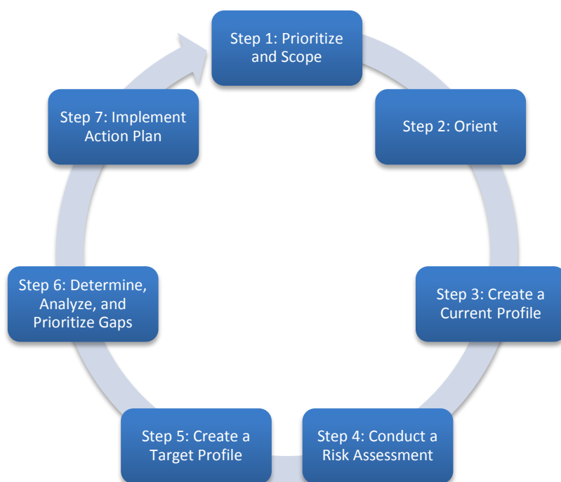
Figure 1. Framework Implementation Approach

Each step is introduced by a table describing the step’s inputs, activities, and outputs. Additional explanation is provided below each table. A summary table of the inputs, activities, and outputs for each step is included in Appendix B.